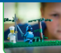
Stop Motion Animation